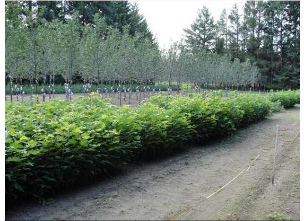
Figure 2. Silver Maple seedlings growing in nursery beds.