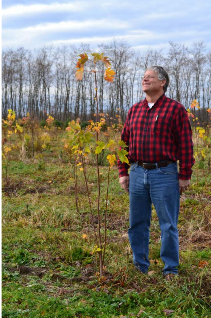
Figure 4. Silver Maple Provenance Test. Fall 2011.