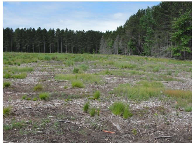
Figure 3. Silver maple seedlings at Dunbar Forest in Michigan's Upper Peninsula, 2 months after planting.